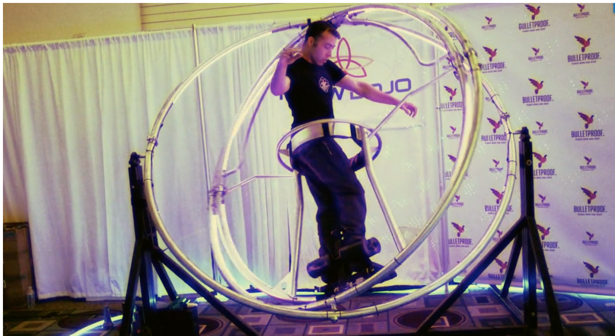
The LED and sound-responsive Gyroscope at the Bulletproof Biohacking Conference.

Once that foundation was in place, we got to the interesting part—the Dojo itself. In our research for The Rise of Superman , we had interviewed over more than two hundred professional and elite adventure athletes to figure out their secret to getting into flow so readily. Time after time, they told us it came down to two things: the right triggers and gravity.