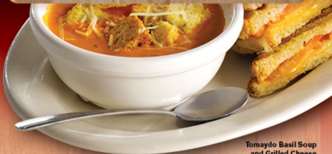
Tomaydo Basil Soup and Grilled Cheese