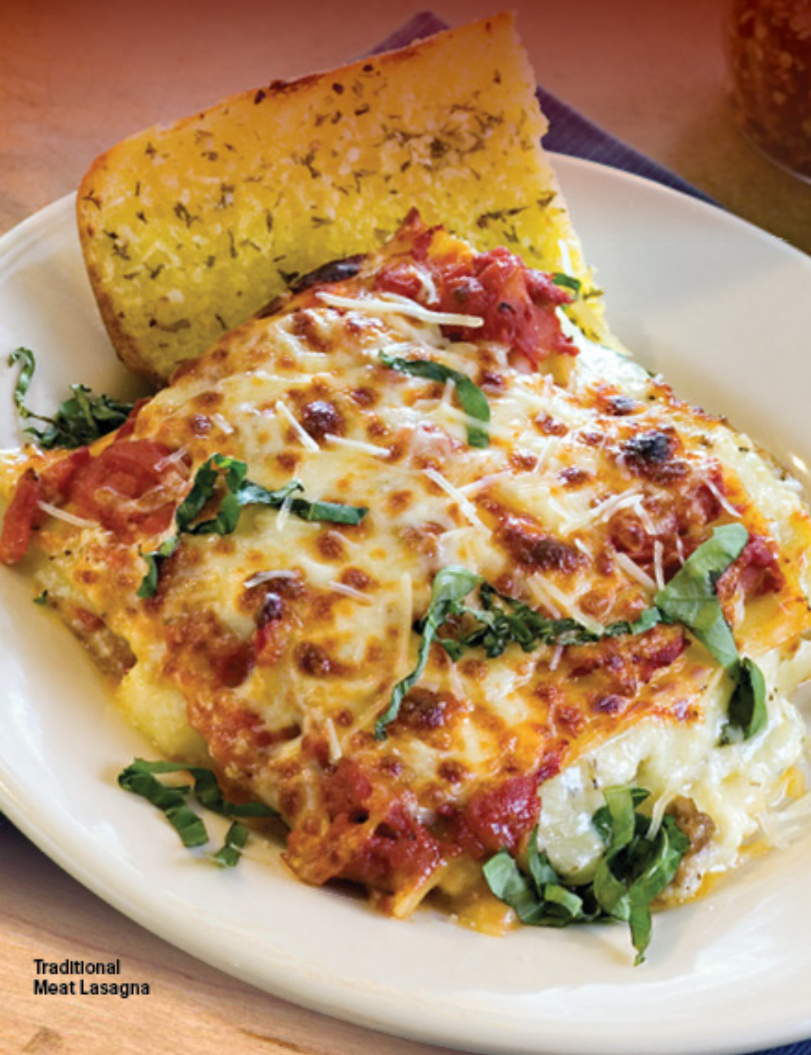
Traditional Meat Lasagna