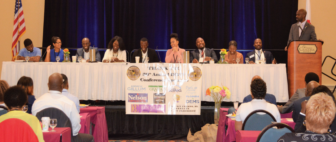
Millennial Round Table