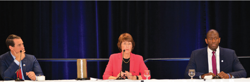
Gubernatorial Democratic Candidates Forum