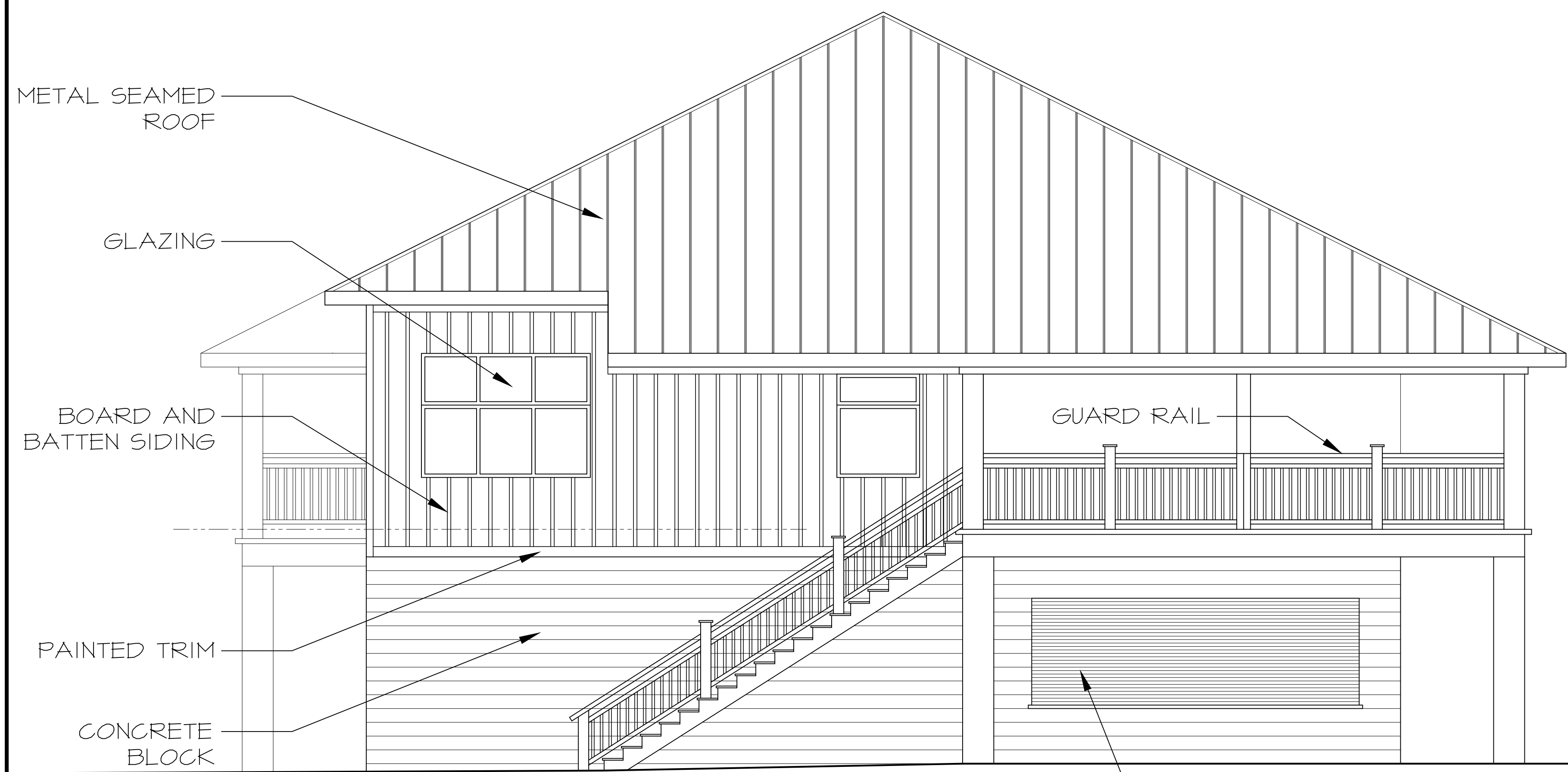
1 NORTHEAST ELEVATION P2.0 SCALE: 1/4" = 1'-0"