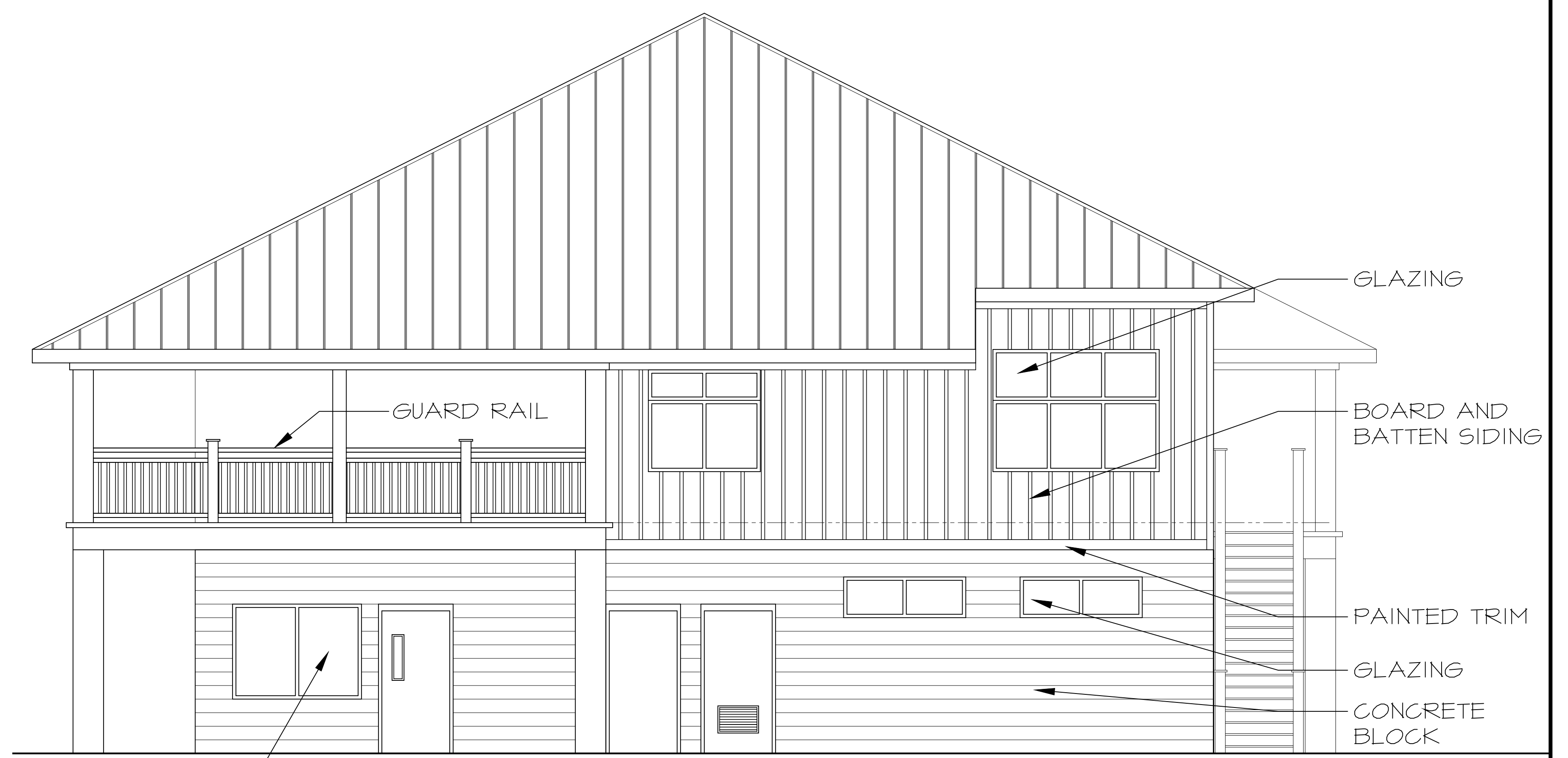
4 SOUTHWEST ELEVATION P2.0 SCALE: 1/4" = 1'-0"