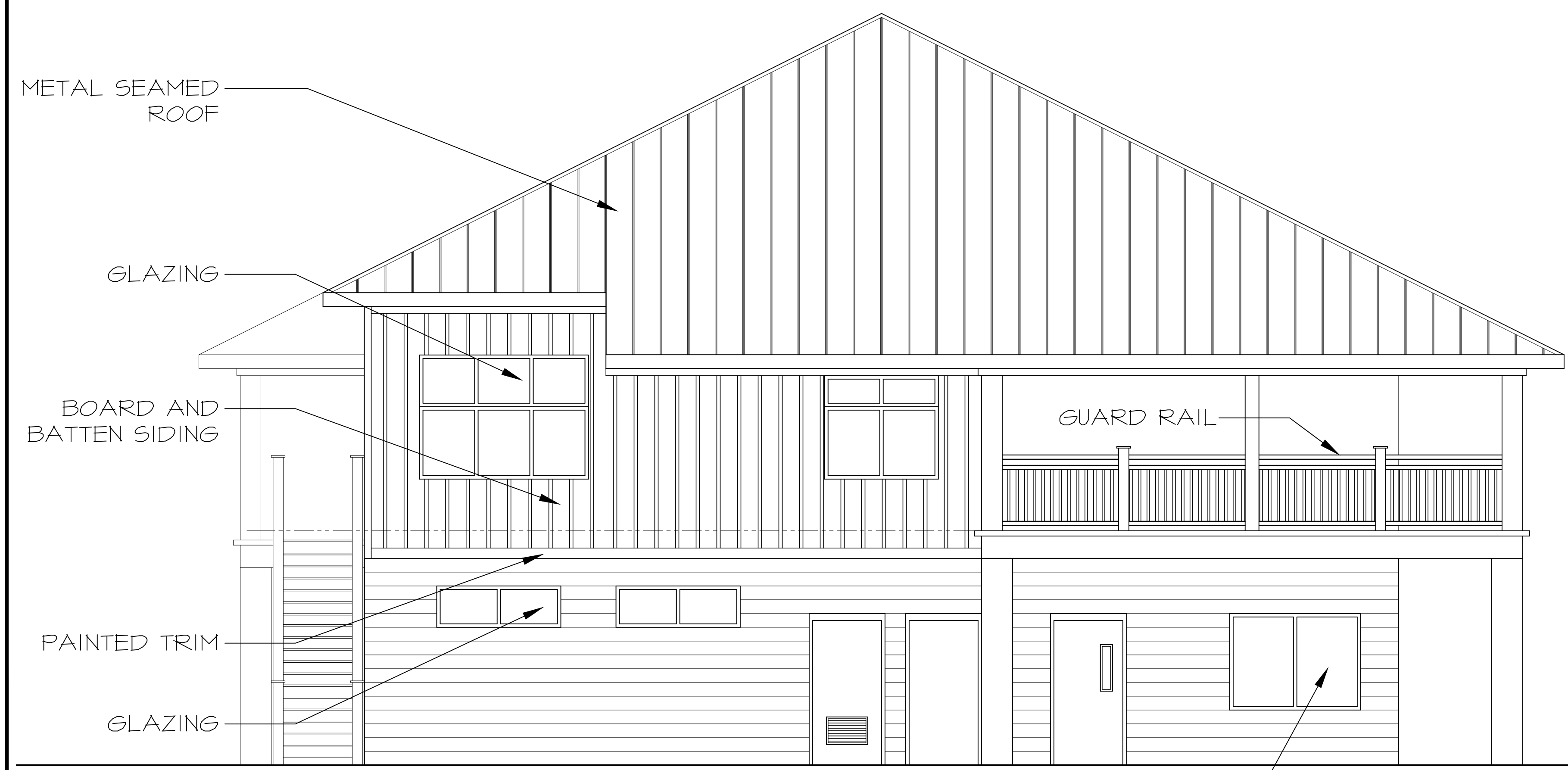
3 SOUTHEAST ELEVATION P2.0 SCALE: 1/4" = 1'-0"