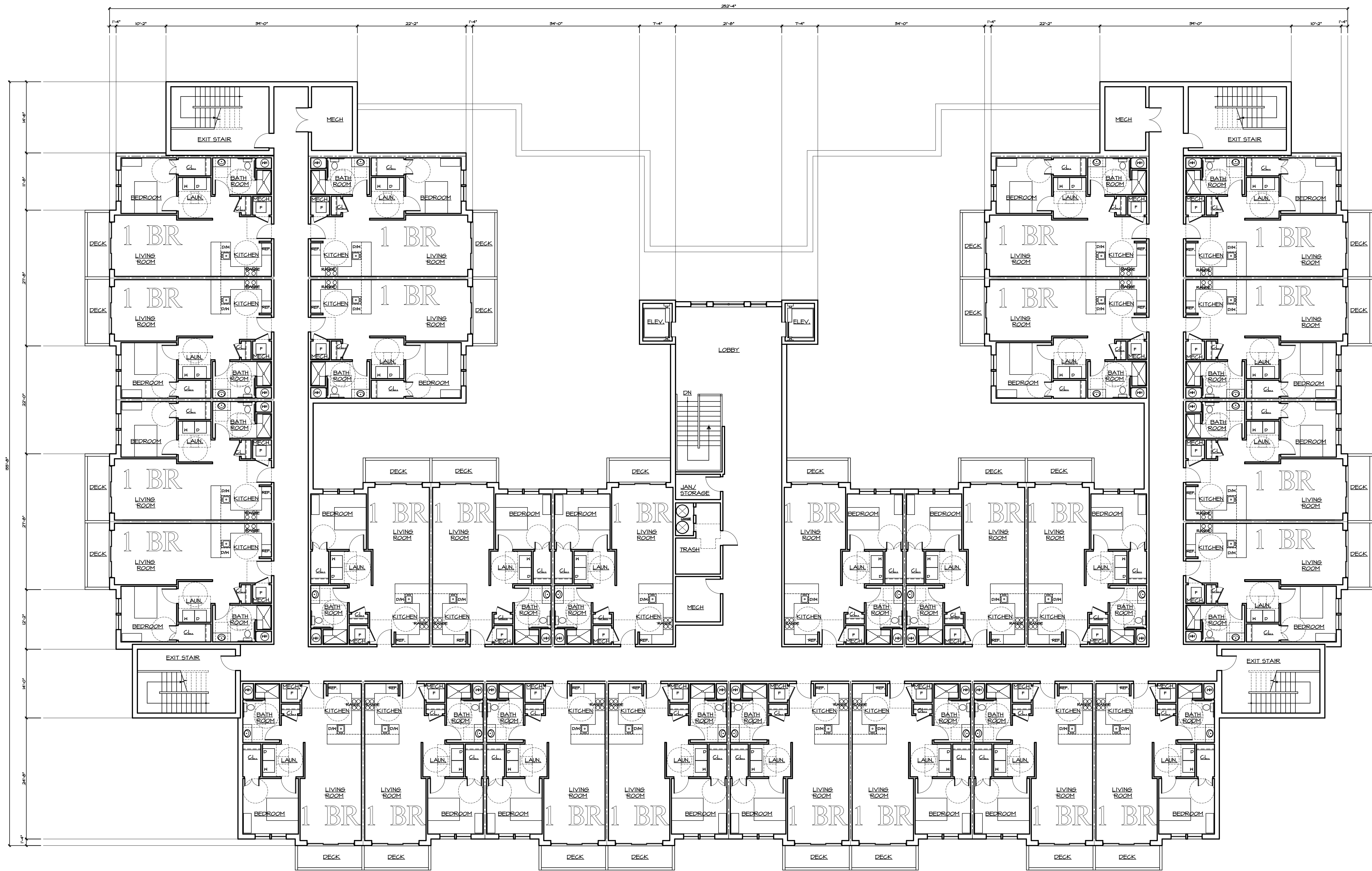
1 THIRD FLOOR PLAN A1.2A SCALE: 3/32" = 1'-0"