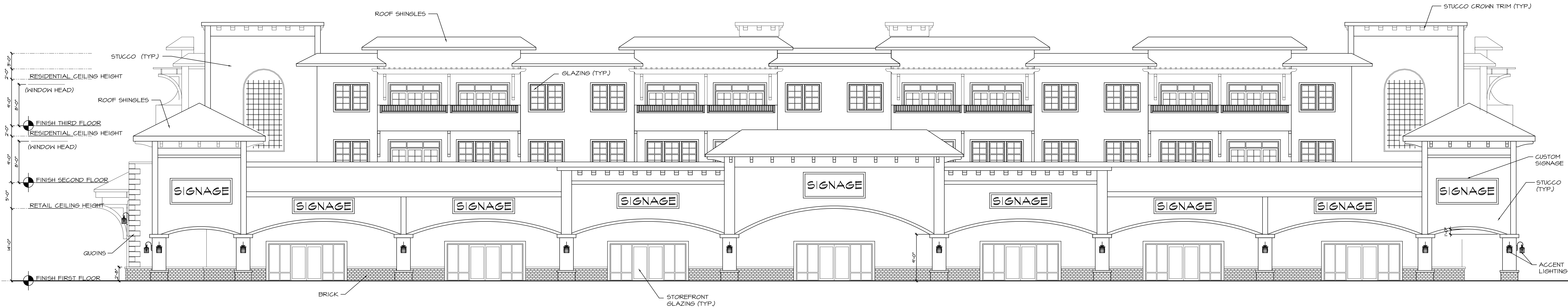
1 FRONT ELEVATION (SOUTH VIEW) A1.3A SCALE: 1/8" = 1'-0"