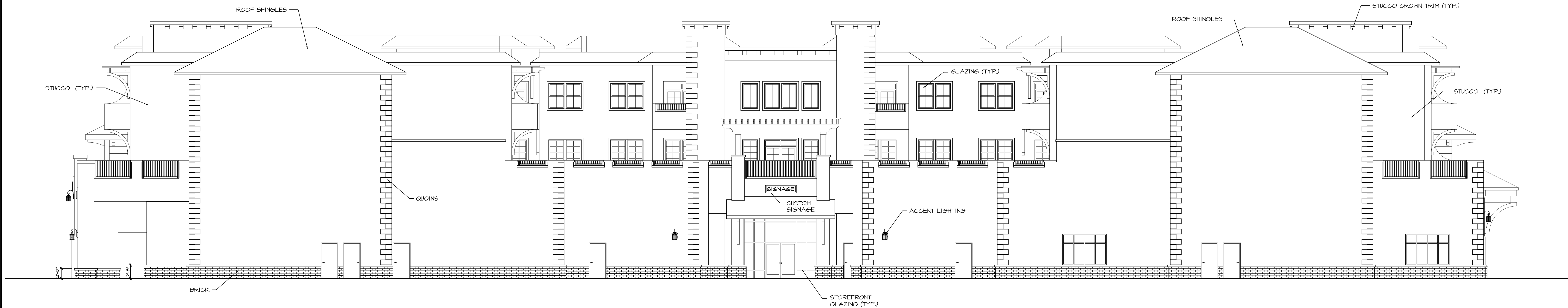
1 REAR ELEVATION (NORTH VIEW) A1.4A SCALE: 1/8" = 1'-0"