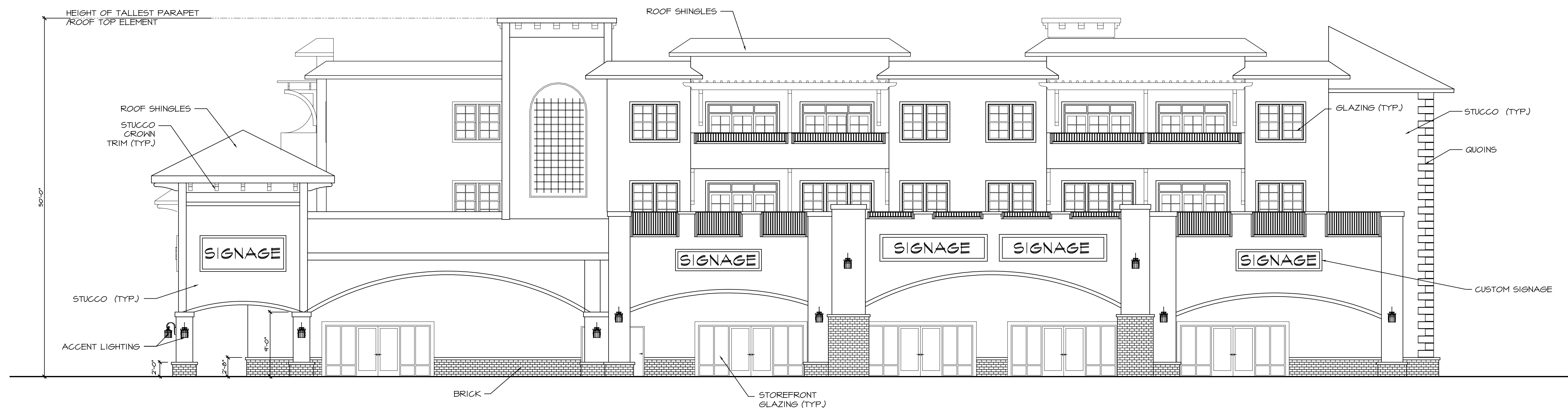
2 RIGHT ELEVATION (EAST VIEW) A1.3A SCALE: 1/8" = 1'-0"