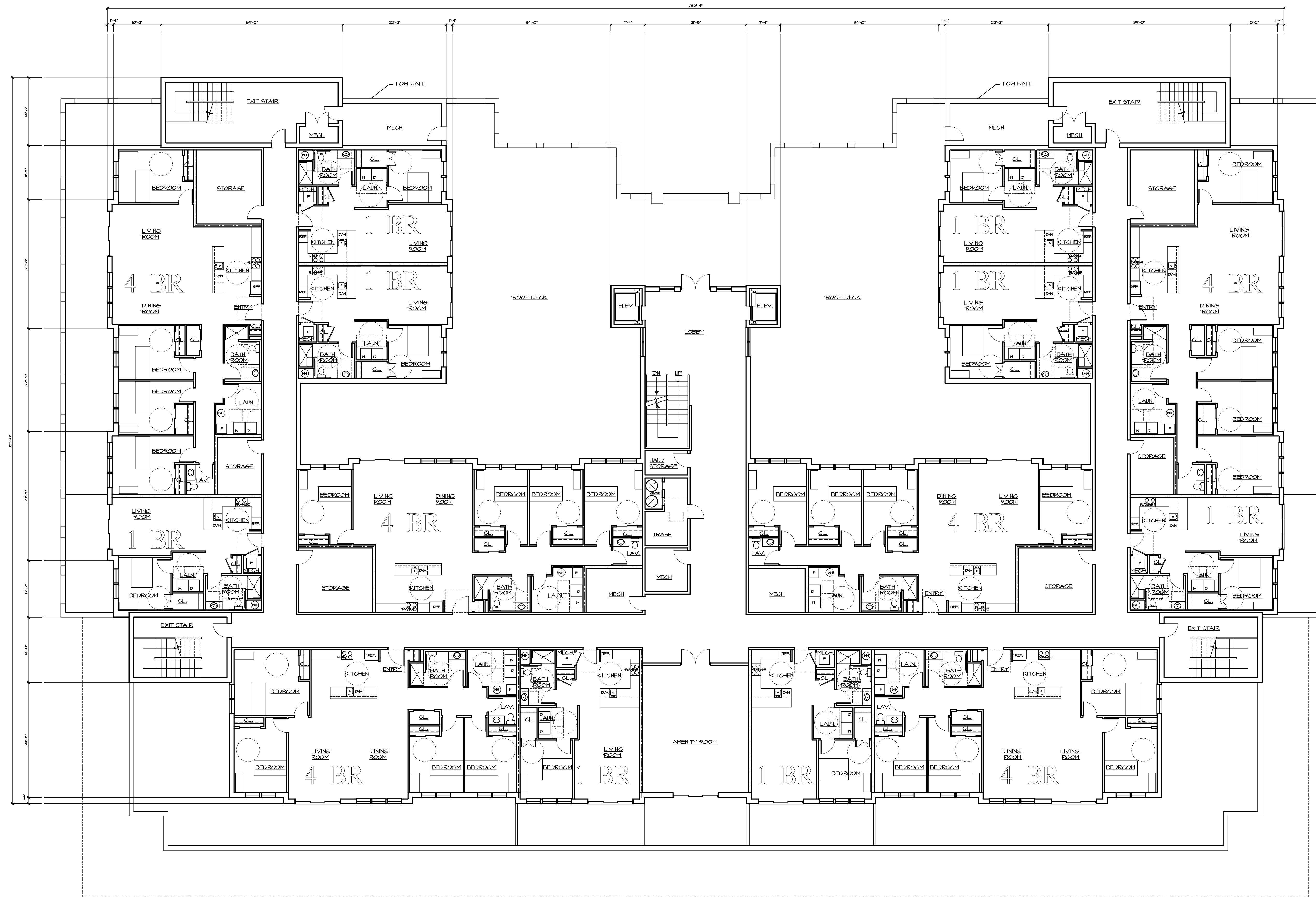
1 SECOND FLOOR PLAN ALIA SCALE: 3/32" = 1'-0"