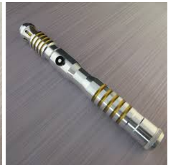
Light Saber Camp Enrollment Package