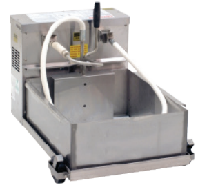
F662A9 SHORTENING FILTER