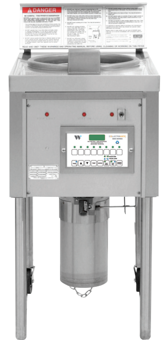
OF49C & OF59C Collectramatic® Open Fryer 8-Channel Programmable Controls